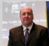
Charles Still Information Systems Team, Southwestern Vermont Medical Center