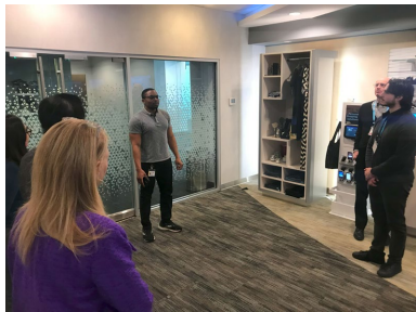
Zebra facility tour

A dynamic panel on the importance of standards featured expert voices from standards working groups that emphasized the ongoing relevance and necessity of standards in today's fast-evolving digital landscape.