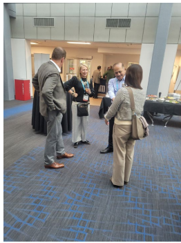
Networking break sponsored by Napeequa Concepts